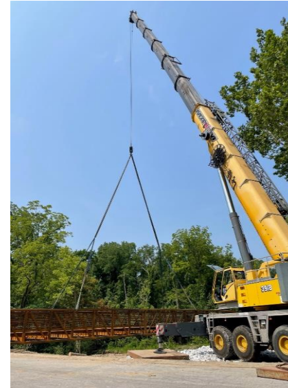
Rotating Bridge 3