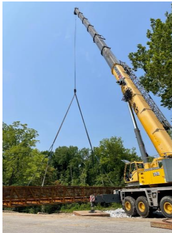
Lifting Bridge 3