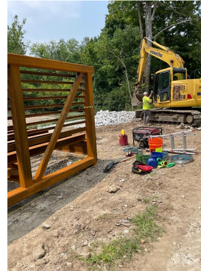
Bridge 3 assembly