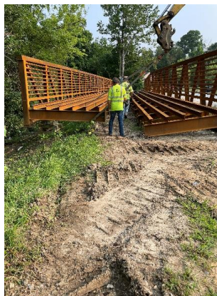
Bridge 3 assembly