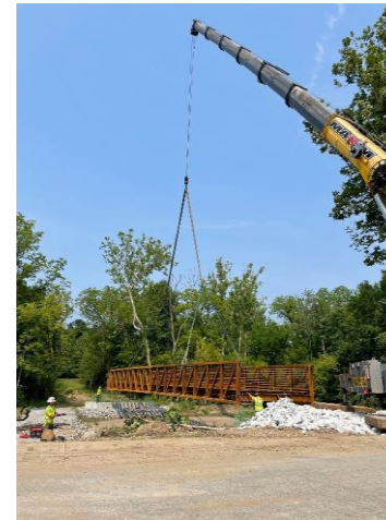
Setting Bridge 3