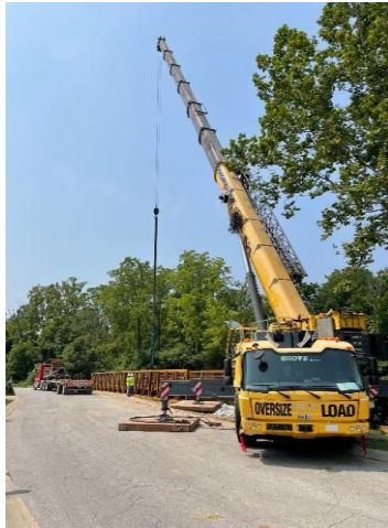
Lifting Bridge 3